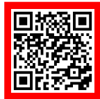
Problem 1: Vehicle

Use the QR codes to the right to upload photos to our Google Photo Albums for the Awards Slide Show. We need your help to make sure your team is included!