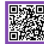
Problem 5: Performance