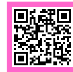
Problem 3: Classics