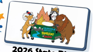
2026 State Pin $5.00