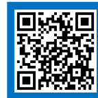
Problem 2: Technical