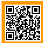
Problem 4: Structure