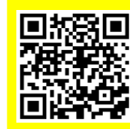
Judges & Volunteers