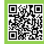
Spontaneous Holding Room