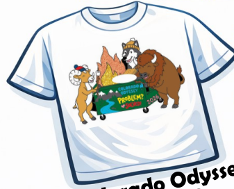
2026 Colorado Odyssey T-Shirt $15.00

Some of these items make great "Thank You" gifts for coaches (hint, hint!)